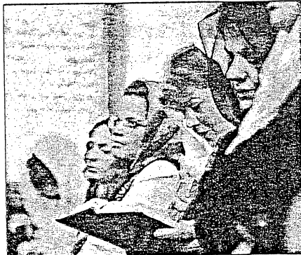
Women at St. Mina Coptic Orthodox Church in Nashville listen to Pope Shenouda III as the new church is consecrated.